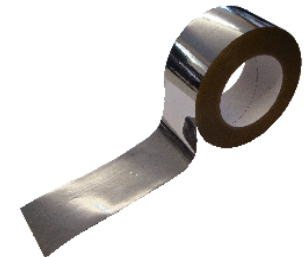
Avaliable roll sizes:

Date Published: V8, August 2024. Novia's most recently published datasheet supercedes any previous versions which may still be in circulation.