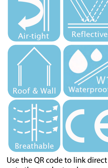
to the product webpage.